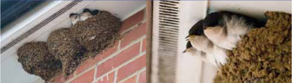
House Martins nesting at Hadham Hall.

On 9th August, I am leading a photography walk for Broxbourne camera club. Again, if any residents wish to join in, please meet at the Village Hall car park for a 10am start.