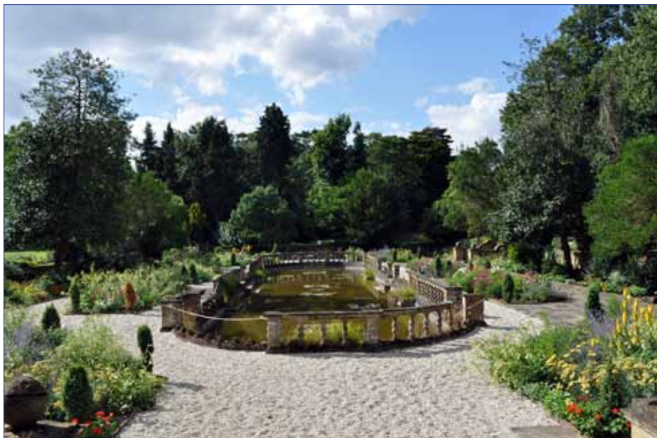
The Italian Garden at Easton Lodge, newly restored. Open Day August 17th (see p 12)